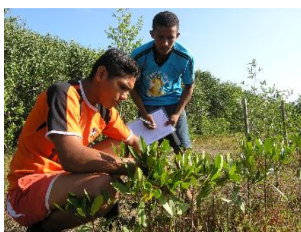
Brazil, 2007, T. Tsuji