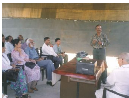
Pakistan, 1995, K. Tsuruda