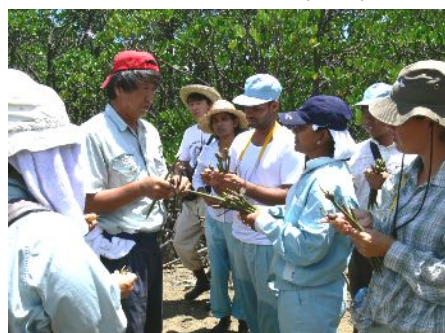
Training Course, 2007, S. Yamagami