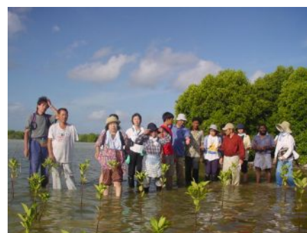
Maldives, 2001