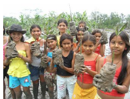
Brazil, 2007, T. Tsuji