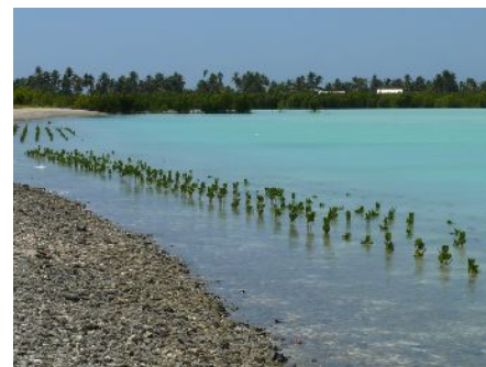
Kiribati, 2009