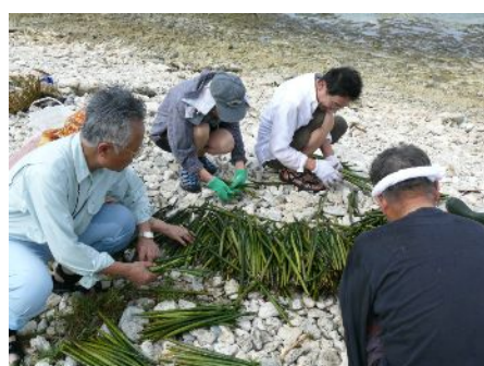
Tuvalu, 2009