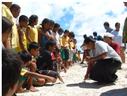
Kiribati, 2005