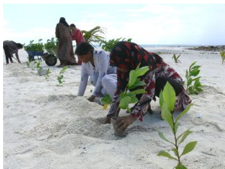
Maldives, 2007