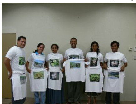
Training Course, 2007, S. Yamagami