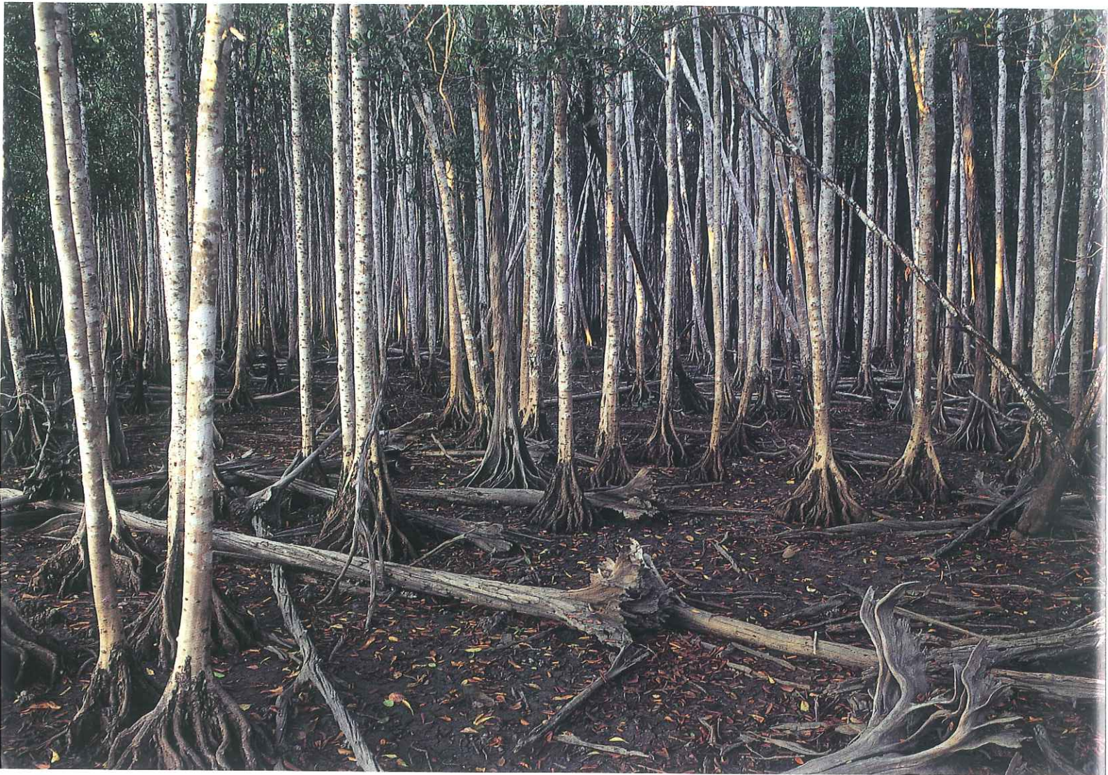
Mangrove forest, Weipa, North Queensland, Australia.