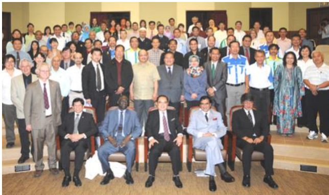
Eight General Assembly of ISME and ISME-SFD workshop on mangroves held at Rainforest Discovery Centre, Sandakan, Sabah.

The Eighth General Assembly (GA) of ISME was held in the Rainforest Discovery Centre, Sandakan, Sabah on 13 September 2011. The Honourable Datuk Peter Pang (Minister of Youth and Sports of Sabah) graced the occasion and presented the Opening Address on behalf of The Right Honourable Datuk Seri Panglima Musa Hj. Aman (Chief Minister of Sabah). Welcoming remarks were delivered by Datuk Sam Mannan (Director of Sabah Forestry Department) and Prof. Salif Diop (President of ISME, 2005-2011). Among the highlights of the GA were the Announcement of the Executive Committee (2011-2014), Activities and Finance, Revision of the Statutes, and Award Ceremony. The GA was attended by participants from Malaysia, Thailand, Australia, France, Japan and India.