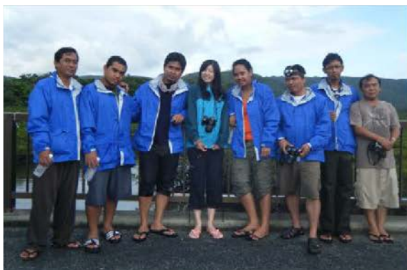
Snapshots from the training courses. Top: Participants from Myanmar, Indonesia, Micronesia and Samoa. Bottom: Participants from Indonesia.