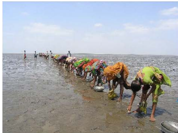
Planting Avicennia marina on the mudflats at Gujarat, India by local communities employed by the project.